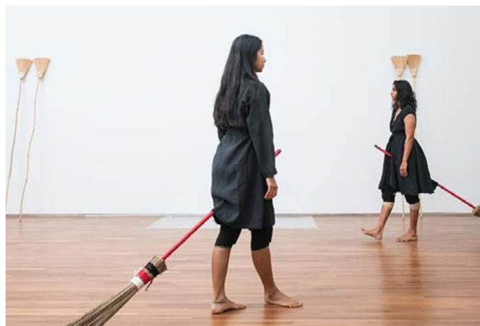
Magic Maids : Sweeping Sisters (a performance art)