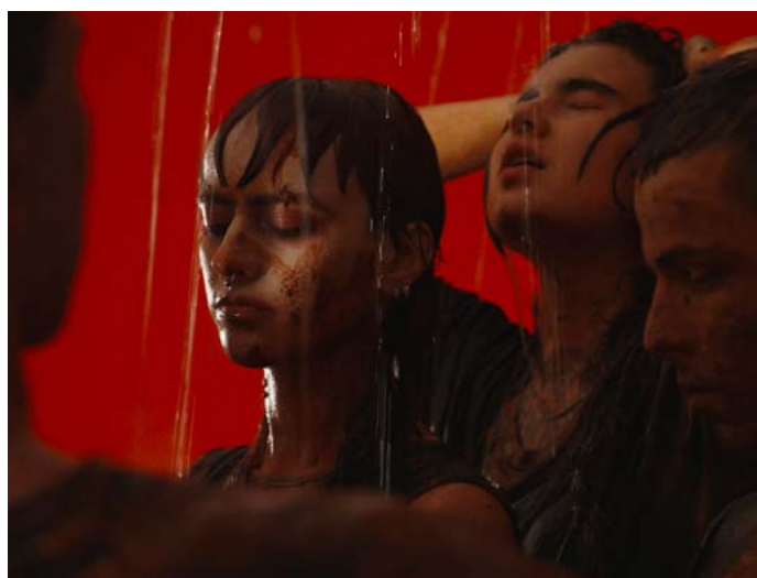
The others : Still from “IN THE SKIN OF A DOG”, 2024.