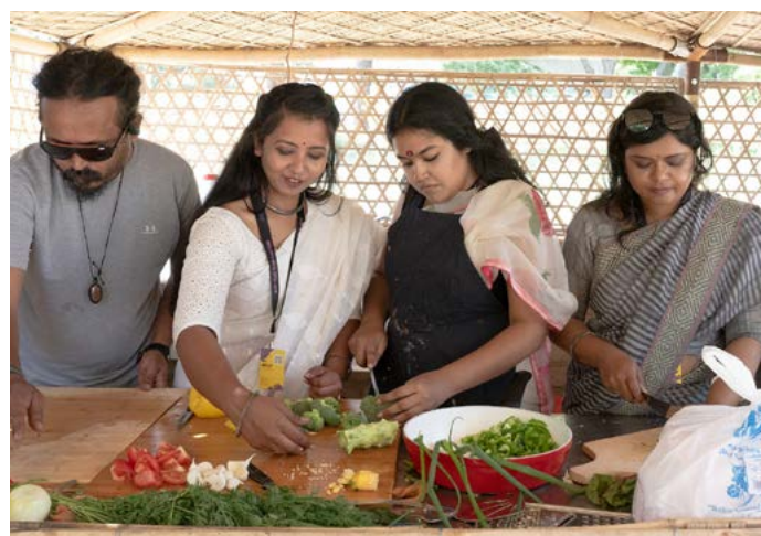
documenta fifteen: PAKGHOR- the social kitchen, Britto Arts Trust, 2022, documenta Halle, Kassel, June 18, 2022

This project was presented as part of After Rain, 2024 Diriyah Contemporary Art Biennale, where the artists welcomed visitors into an ecological, social and diasporic space defined by the structures of the Bengali palan and pakghor. The palan, a traditional vegetable garden usually tended by women and children, feeds the pakghor, a family kitchen that resembles a living room.