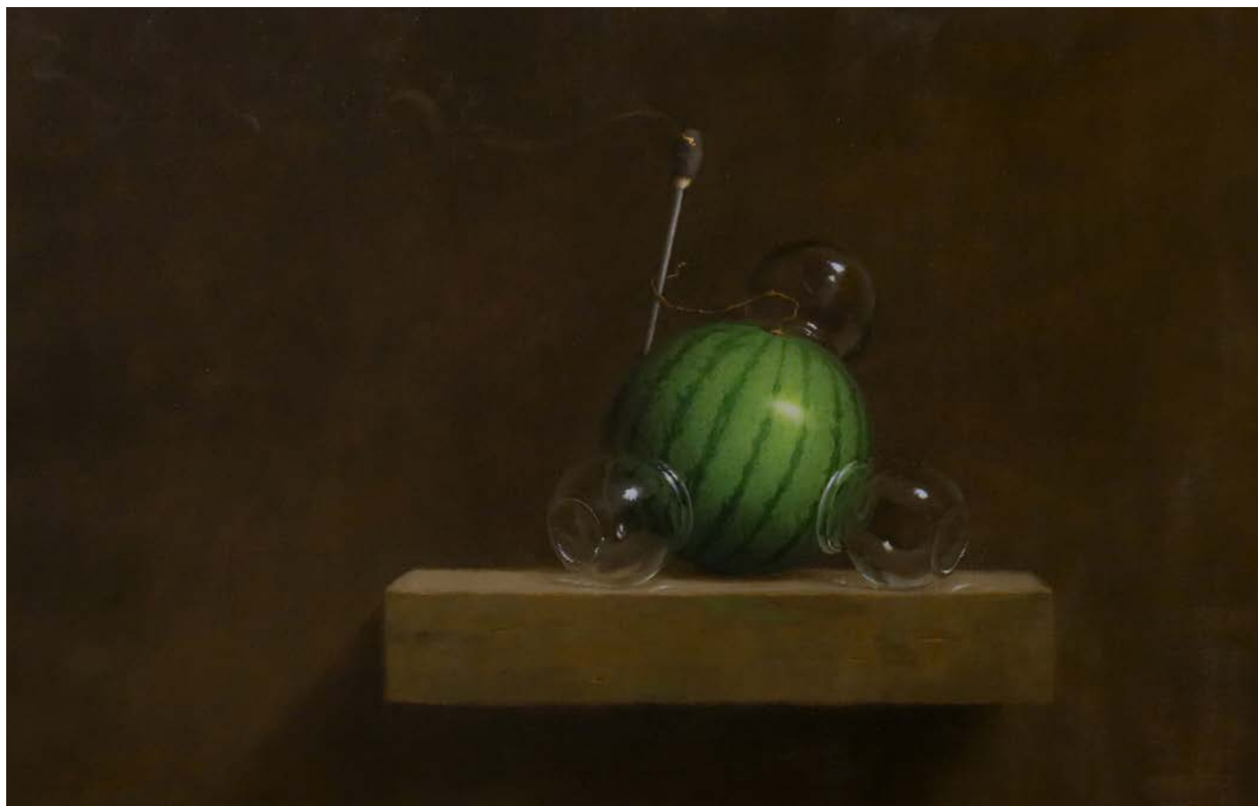
Yachin Chang, Watermelon Needs Cupping Therapy , 2024. Oil on Linen, ©Yachin Chang Courtesy of the artist and Perrotin.