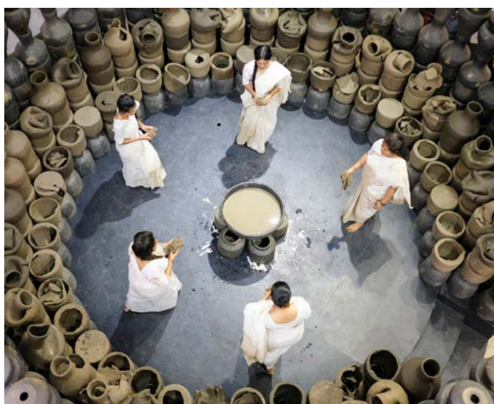
Performance view of a rain ceremony during They Who Brings Rain Brings Life, Counterspace’s contribution to the 2023 Dhaka Art Summit.