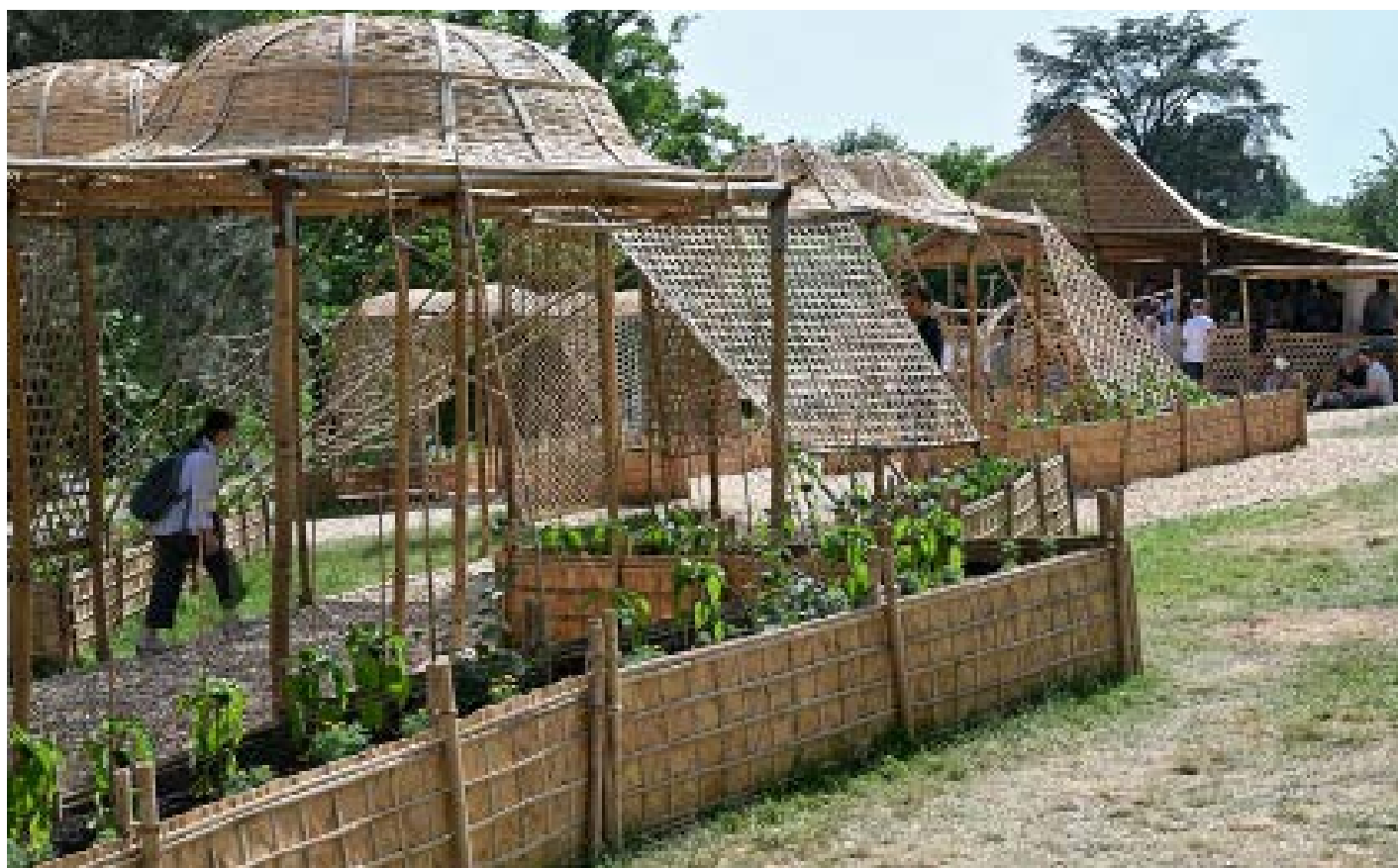
documenta fifteen: PAKGHOR - the social kitchen, Britto Arts Trust, 2022, documenta Halle, Kassel, June 18, 2022