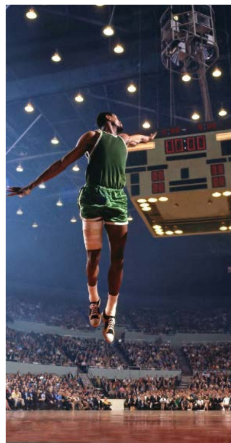
Paul Pfeiffer, Four Horsemen of the Apocalypse (35), 2024. Courtesy by the artist and carlier | gebauer